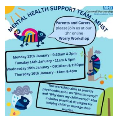
Worry Workshop -

A Teams link will be emailed to you from MHST for each workshop prior to the workshop taking place.